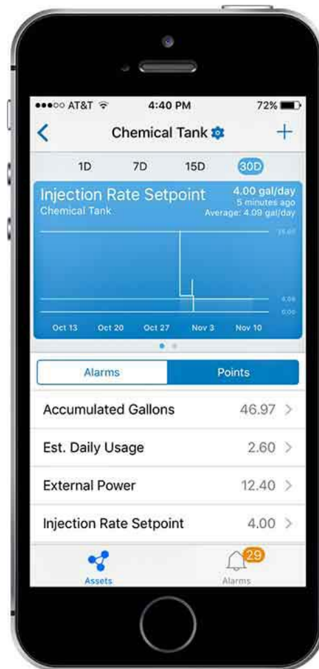
Image 3. Mobile apps provide reports and alarms that can be delivered via email or SMS.

The process of capturing site data, storing it in the cloud and sharing it via the web (or iOS/Android-based apps) keeps all stakeholders on the same page.