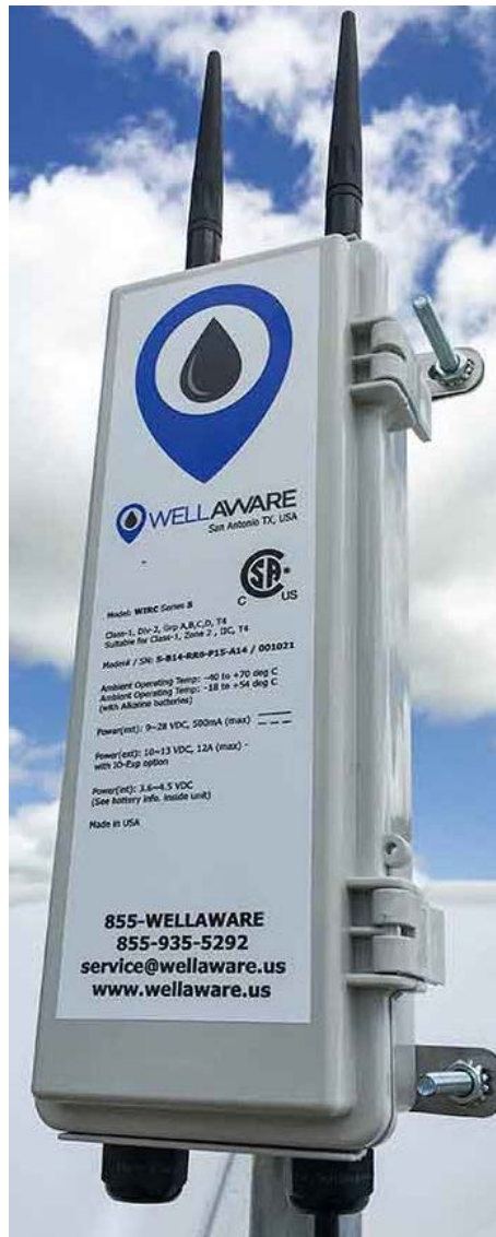
IIoT networks now connect rural and remote well sites that were once isolated from a communications standpoint.

Hardware – Intelligent edge devices wired to industrial sensors can monitor and control critical metrics for chemical management applications, including pump rate, tank levels and production rates. These devices possess the logic needed to make decisions and control operations locally, and they transmit data back to the cloud for additional analysis.