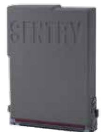
Measuring 5 in x 3.8 in x 1 in, 120Z Cargo Companion travels with your cargo