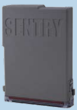
SENTRY 400 FlightSafe 5 in x 3.8 in x 1 in 12oz

Numerous evaluations on SENTRY FlightSafe have been completed by the maintenance; flight operations; safety & hazardous materials; ground operations; and engineering teams of numerous commercial and cargo airlines.